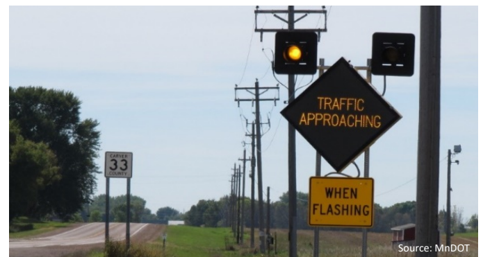
Activated intersection conflict warning system in Carver County, Minn.

Also addressing rural intersections, the Minnesota Department of Transportation investigated the effects of Intersection Collision Warning Systems (ICWS) at five unsignalized intersections throughout Minnesota. Using video collected at both treatment and control intersections all conflicts and near-crashes were identified. The number of near-crashes observed decreased by 26 percent overall at the five treatment sites while increasing at the untreated control sites (2017-01204) .